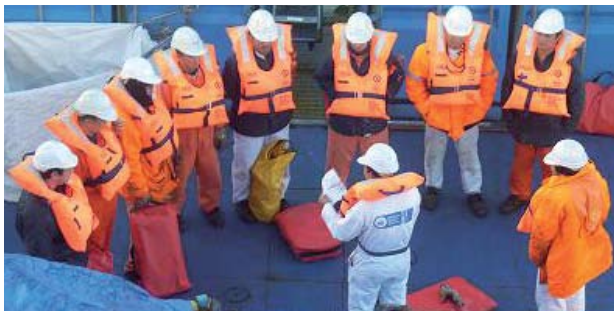
Crew from OMS quest involved in steering gear failure and Fire drill training on board.

In times of high stress the human brain will revert to behaviours and processes which are learned. Getting involved in the drills and learning how to respond in a